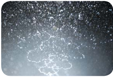
Larger, more uniform droplets visible only with strobe light illumination.

With a standard precipitation rate of 1" per hour or less, these revolutionary nozzles use 1/3 less flow to reach the radius of a conventional spray nozzle. Also, H 2 O Chip technology allows for a larger, more uniform droplet size, which means more consistency and watering accuracy, resulting in less runoff. Male and female threaded models are available. TORO