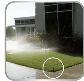
Spray body with broken nozzle with x-Flow