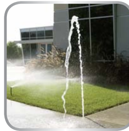
Spray body with broken nozzle without x-Flow

Ideal for landscapes with high or varying operating pressure (including sites with long pipelines and slopes). The unique x-Flow feature will restrict water loss by 99% if nozzles are broken off. TORO.