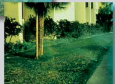
With Pressure Regulation