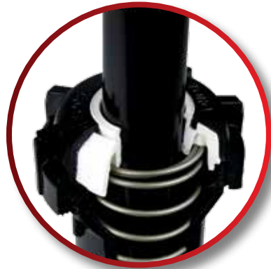
Enhanced zero flush seal

System start up is a critical time when water waste can occur. The Toro 570Z Series spray head's wiper seal is pressure-activated and prevents flow-by at start up, meaning no water is wasted and more heads can be installed on the same line.