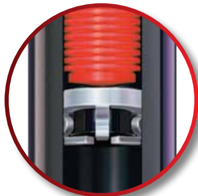
Patented X-Flow® Shut-off Device

Up to 40 gallons of water per minute can escape through a spray head that has a missing or damaged nozzle. This wasted water can lead to landscape erosion, property damage, or unsafe conditions due to wet hardscapes. The patented X-Flow device is factory-installed in the riser and holds back over 99% of the water that would otherwise be wasted in cases where the nozzle has been compromised through unintentional accidents or vandalism. Furthermore, X-Flow technology allows for spray head maintenance or component replacement without the need to turn off the system.