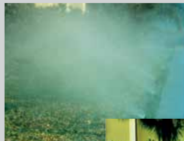
Without Pressure Regulation